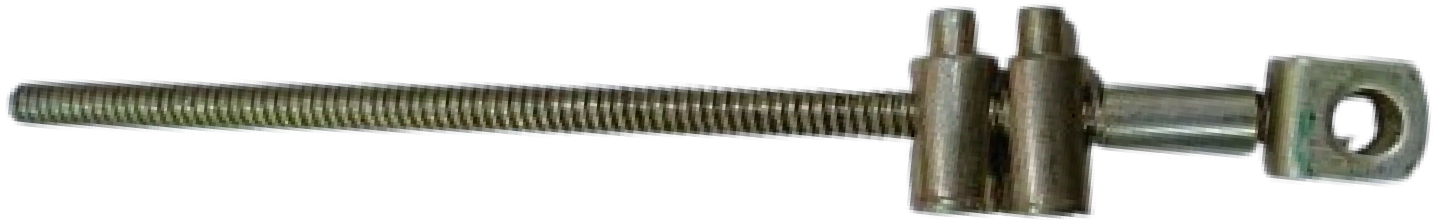
RE SCREW JACK